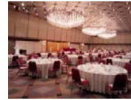
Hotel Grand Palace