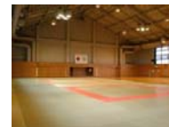
Tokorozawa Shimin Budokan

2 nd seminar by Yasuo Kobayashi soshihan: 11:45 – 12:45